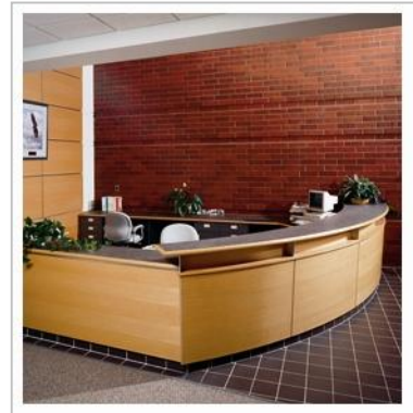
Reception Counter Wright-Hennepin Cooperative Rockford, Minnesota

TMI is exceptionally effective in merging artistry and design with the various functional requirements of reception areas. Workspace needs to accommodate computers and telephones, and all of the accompanying cables and wires. There also needs to be ample counter space for the completion of paperwork and other tasks.