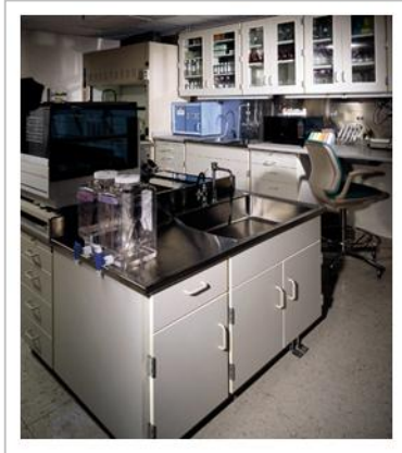
Histology Lab Scottsdale, Arizona

Evolving technology and changing dynamics in the healthcare industry have levied new and exciting challenges upon medical labs. Optimum efficiency is critical. Properly designed casework such as that shown at the left will help keep a lab running efficiently. Details such as foot-operated faucets add convenience, while elements like glass insert doors provide easy viewing of supplies and keep storage areas clean and dust free. Epoxy and stainless steel countertops and integral sinks resist acids and chemicals, wiping clean with ease.