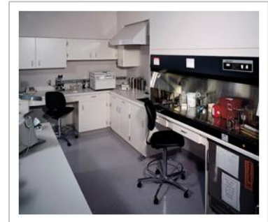
Microbiology Lab Summit Medical Center Nashville, Tennessee

As in all laboratories, the casework in medical labs needs to be durable. At TMI, we build for strength and durability. Heavy-duty five knuckle hinges are used on doors that open and close 24 hours a day, and epoxy powder coated steel frames bear heavy loads across extra wide knee spaces. Such durability enables TMI's casework to stand up and serve even as procedures, technology, and techniques change. We build it strong to keep up with the rapidly accelerating pace of research and to continuously support demanding applications.